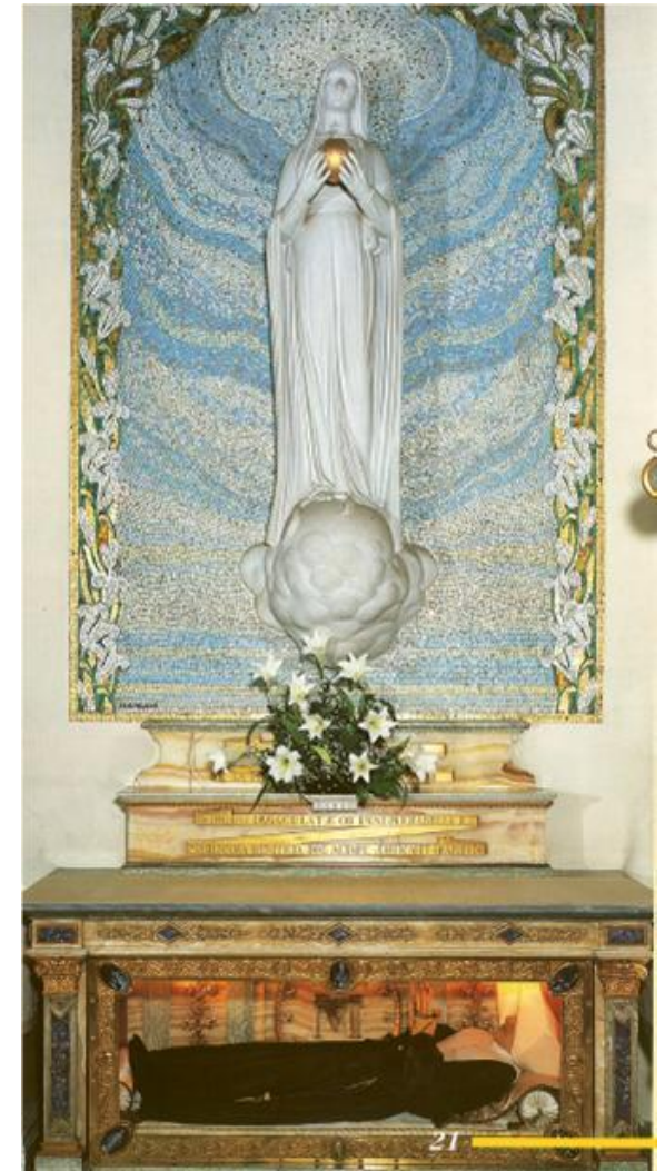
Incorrupt body of St Catherine Labouré which lies beneath the statue of Mary in the chapel of the Mother House of the Daughters of Charity at 140 Rue du Bac, Paris. ("A Light Shining on the Earth. The Message of the Miraculous Medal. The Fiftieth Anniversary of the Canonisation of St Catherine Labouré 1947-1997",) Printed with permission.